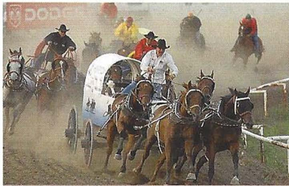
Calgary Stampede Chuckwagon Races