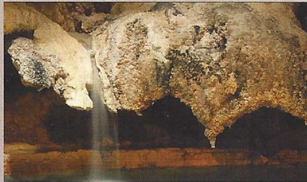
Cave at Basin National Historic Site