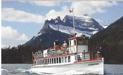
Waterton Lake National Park Lake Cruise